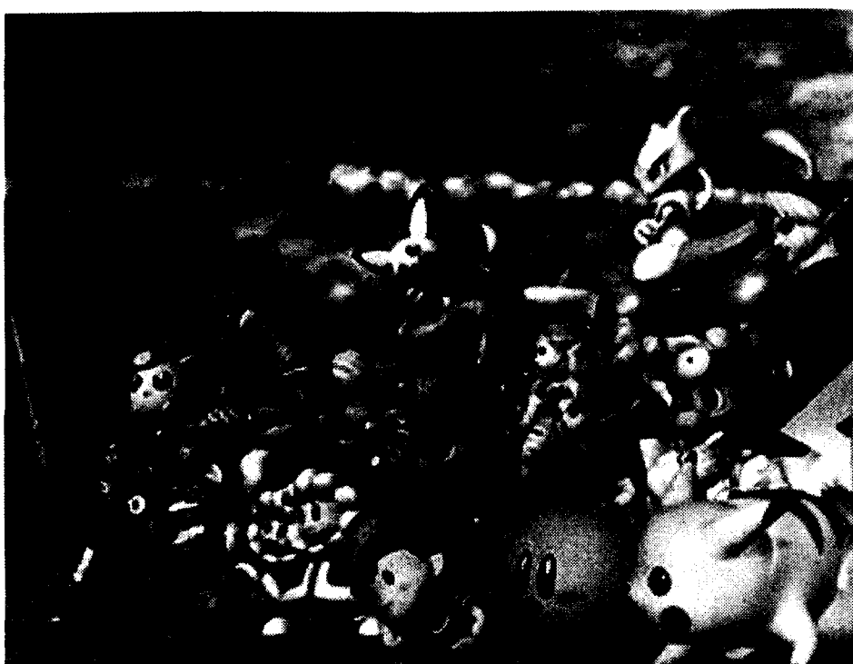
The highly anticipated "Super Smash Bros. Brawl" (Wii) allows players to battle using an array of characters spanning over 20 years of Nintendo history.

"Metal Gear Solid 4: Guns of the Patriots" for Play Station 3 – So much media coverage has been given to the fact that this game's main character, Solid Snake, is being included in Super Smash Bros. Brawl, that his own game is somewhat overlooked by non-fans. Rest assured, however, "Metal Gear Solid 4" does not disappoint. In addition to improved graphics and a great storyline, the game has significantly less controller lag than