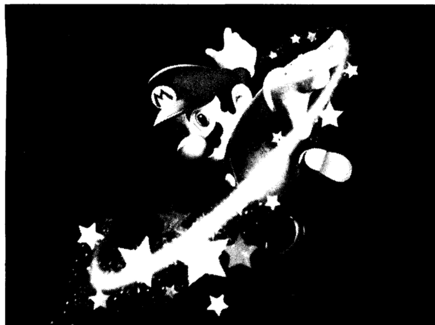
Super Mario flies around in a whirlwind of stars in Nintendo's newest plumber hero release.

The A button will make jump to Mario, and if you tap this button consecutively, Mario will perform progressively higher jumps.