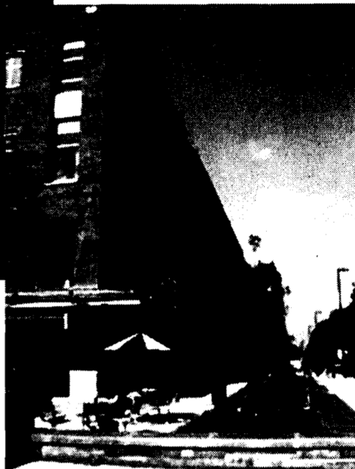
Berkey Creamery gives PSU students a chance to 'chill' out and enjoy their favorite flavors.

The instrumental playing is phenomenal and the lyrical singing is delightful. Fan interaction is constant, so brush up on your Penn State cheers.