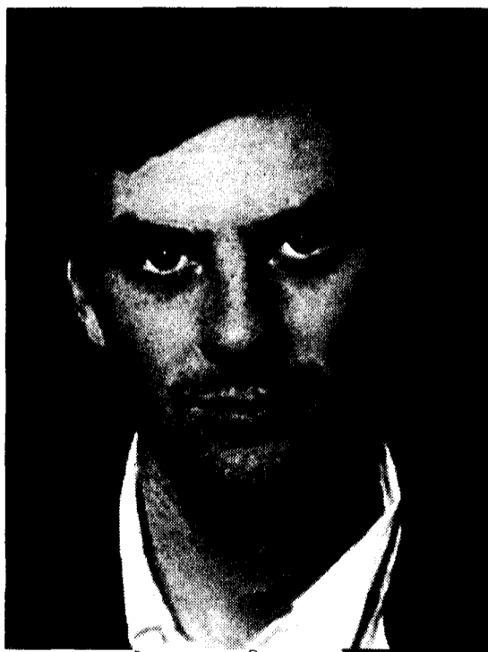
The Trailer for There Will Be Blood can be viewed at http://www.ifilm.com/video/2893739?ns=1

Mark Wahlberg portrayed Eddie Adams, better known as Dirk Diggler, throughout his voyage from a dishwasher, to porn sensation, to his limelight downfall and to his resurrection. The film also featured Burt Reynolds, Julianne Moore, John C. Reilly, Don Cheadle among others. The film was nominated for three Oscars including Best Supporting Actor (Reynolds), Best Supporting Actress (Julianne Moore) and a nod for Anderson himself in the Best Original Screenplay category. Regardless of the extremely controversial subject matter, the film was a summer success, becoming one of the most