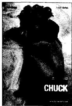
Dane Cook, Jessica Alba, 1 Hour, 36 Minutes