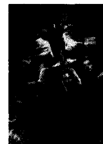
Ioan Gruffudd, Jessica Alba, 1 Hour, 32 Minutes

Sweet. Another super-hero movie. I grew up watching every cartoon that they put on TV. Therefore, every time one of these movies comes out, I go see it on opening day. Not on opening night at midnight, I didn't read the comic books and I don't dress up. I have better things to do with my time, like sleeping for example.