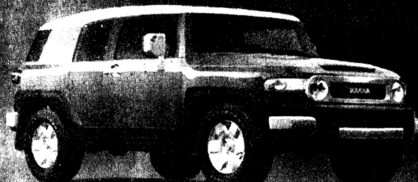
2007 FJ CRUISER†