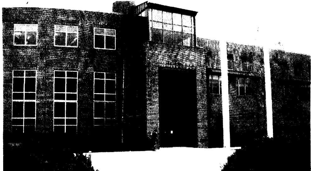
Stacks Market has been a staple at PSH for a few years, replacing the basement cafeteria