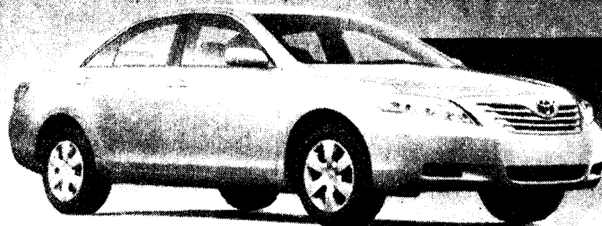
2007 CAMRY HYBRID