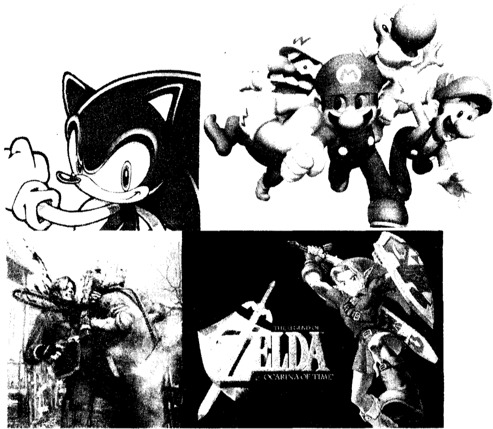
arcade classic Donkey Kong.

No list of revolutionary videogames is complete without the original Super Mario Bros. The game's title character, the heroic plumber named Mario, first appeared as "Jumpin'" in the