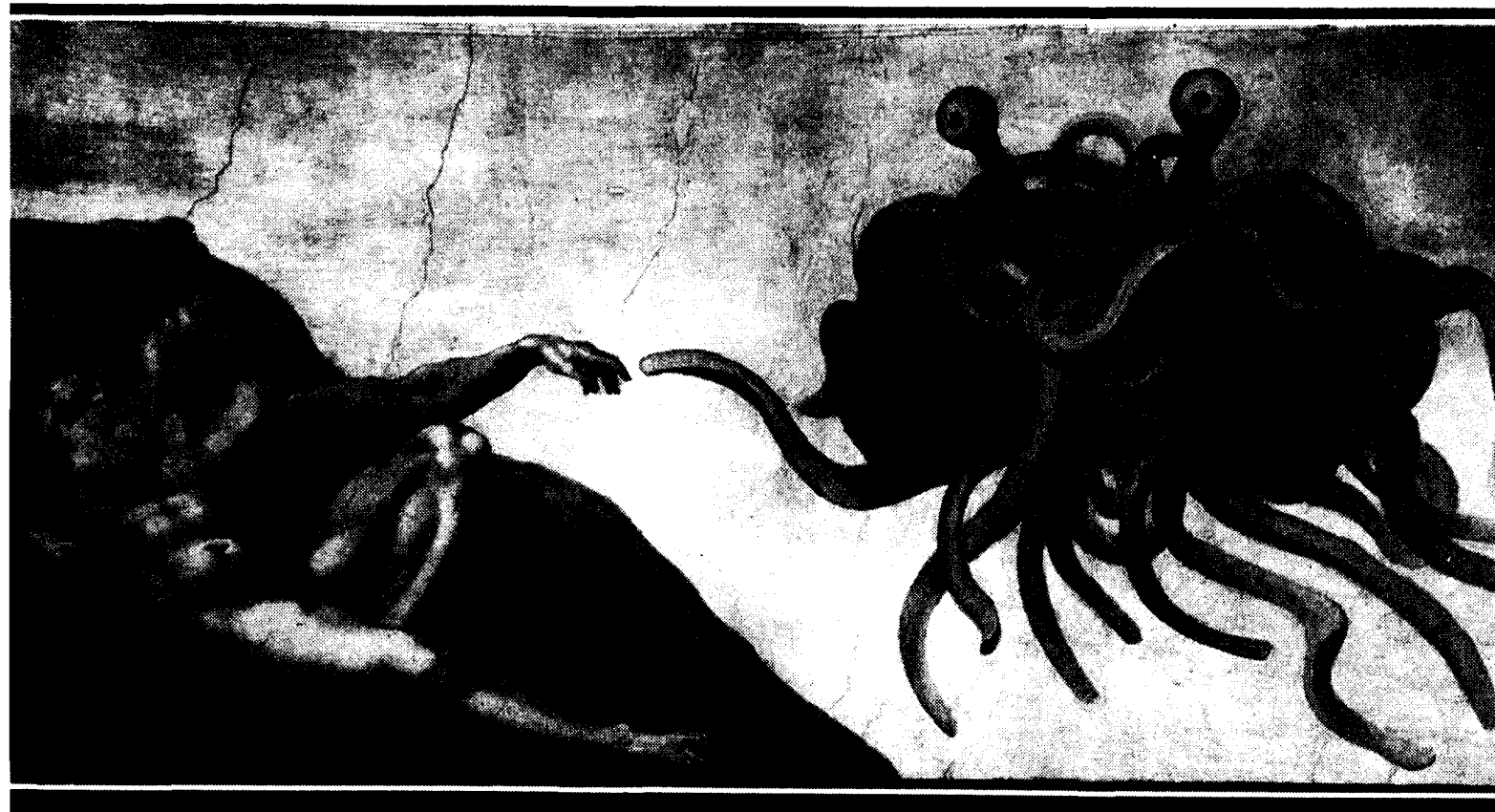
This picture titled, "Touched By His Noodly Appendage," is a popular picture associated with the Church of the Flying Spaghetti Monster. More information on the Church of the Flying Spaghetti Monster and its followers, the Pastafarians, can be found in the book, "The Gospel of the Flying Spaghetti Monster."

And so, with that brief glimpse into the topics a sleep deprived geek mind can come up with, I bid you farewell for this edition. I go to seek that elusive quarry known as sleep. Until next issue my geeky brethren.