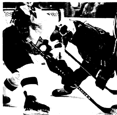
Penguins' Sydney Crosby faces off against Panthers' Gregory Campbell.

Belfour made 39 saves, including several key stops in the third period to keep the score tied at 1.