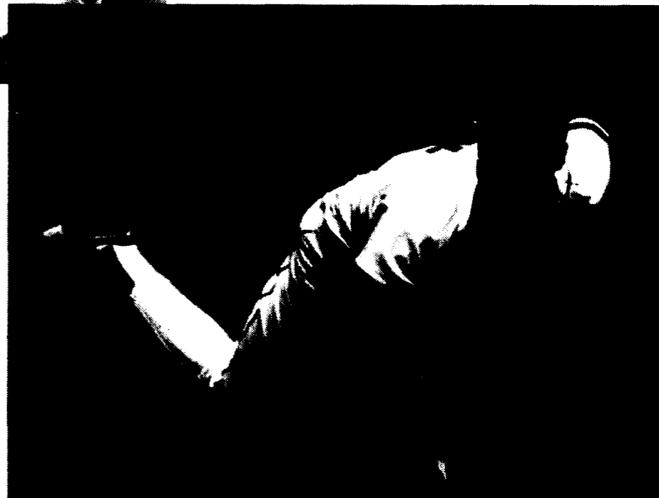
Roger Clemens' baseball career is as up in the air as his famous fast ball. Much speculation has surrounded his indecision about his pitching future, with the majority coming from his beloved fans and prospective teams that want to have "The Rocket" on their pitching rosters.

As a huge baseball fan, I really hate to see fans throw stuff on the field and completely disrespect the game. But if I was Barry Bonds, I'd keep my head down, because more syringes are on the way.