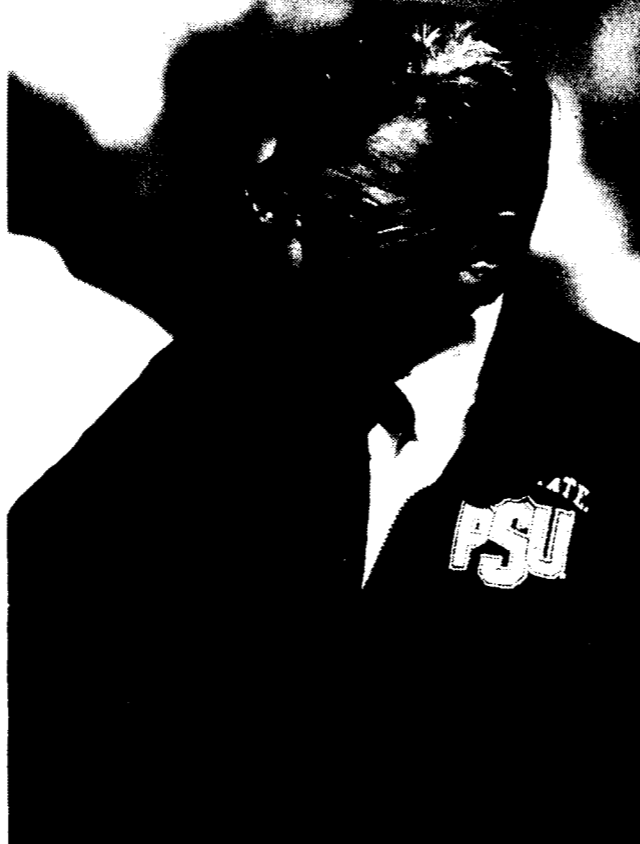
Joe Paterno keeps a watchful eye on his Nittany Lions as they practice for the upcoming 2006 Penn State season. Not a word was uttered by either Paterno or team members at the exclusive sneak peek practice.

So the peek into practice was more an avenue to gather clues as to where players might stand on the depth chart. Penn State lost 13 starters from last year's 11-1 squad, including the entire starting secondary, three of four starting defensive linemen and four of five starting offensive linemen.