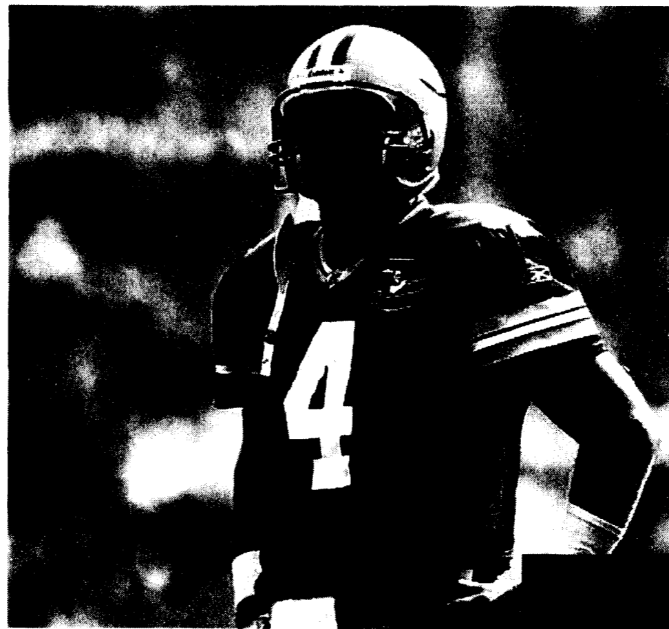
The Green Bay Packers' Brett Favre has kept his NFL plans under wraps, much to the irritation of his fans, who have called Favre selfish. These people tend to not realize how much Favre has going on when they make these claims.

This should not even be a question and the only reason I'm even discussing it is that way too many people seem to think Favre actually is being selfish.