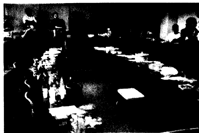
The Spanish Club's open house provided a vast array of Spanish dishes to those who attended their hit event.

This event would involve not only a dance, but also casino games and prizes. The event would be held in order for the club to get students on campus together socially and to just have fun. The club is also talking