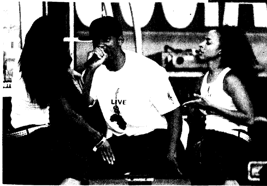
Philadelphia native Will Smith, center, performs with DJ Jazzy Jeff during the Live 8 concert.

Around mid-afternoon, Will Smith took the stage and figuratively set the crowd on fire, setting the mood for the rest of the evening. He asked the crowd how many