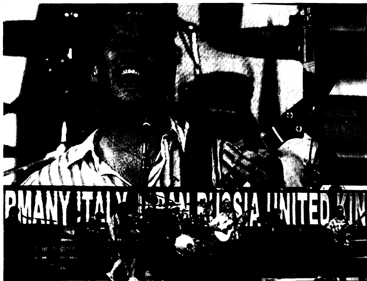
Shown on a video screen above the stage, lead singer Dave Matthews of the Dave Matthews Band performs during the Live 8 concert in Philadelphia.

For more information on Live 8 visit http://www.live8live.com .