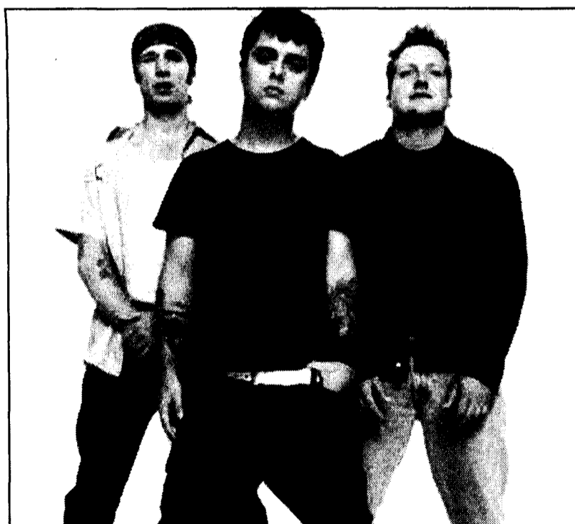
Punk band Green Day recently played a concert at the Giant Center with fellow bands Sugarcult and New Found Glory

exploding flash pots, and confetti to make their show just that much better. The crowd really got into it. Everyone was on his or her feet the entire time. The crowd on the floor was either in a mosh pit or was body surfing through the crowds to the waiting security officers on the other ends of the gates - all in all a fabulous night at the Giant Center spent with Green Day. This concert opened my eyes and I have actually gone out and bought my first punk rock CD. I recommend if you ever get the chance to do something out of the ordinary, DO IT!