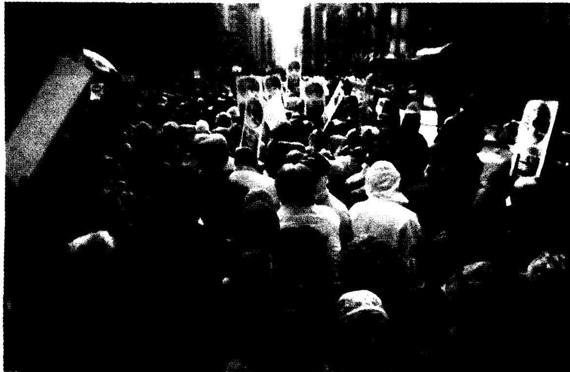
ABOVE: Demonstrators filled the streets of New York City on Saturday, February 16 to protest the possible war with Iraq. Protesters staged rallies in almost every major city across the United States as well as some overseas.