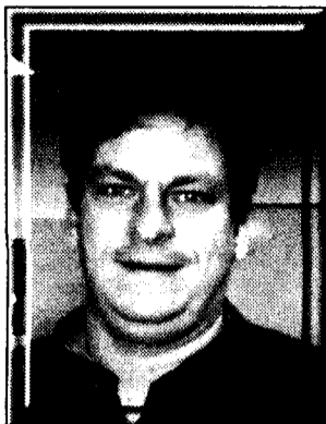
"head to Florida"