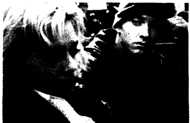
Brittany Murphy and Eminem in a scene from the film