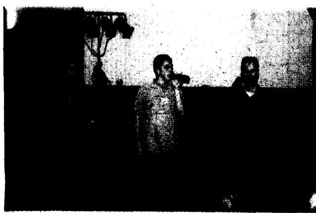
Boost treats spectators with covers of Lit, Blink 182, Sublime, and Everclear.