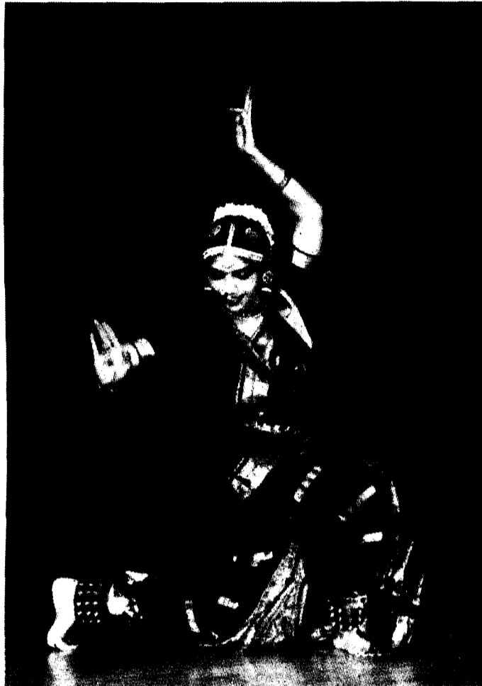
Payal Parek kicked off the festivities with an Indian dance, which preceded the fashion show

"The PSH community this semester includes 82 international students; 13 from India, Howard said."