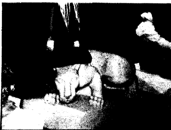
Lion sports witch's hat and plots on scaring people.

Fall Fest 2002 was held on Oct. 30 and 31 in Olmsted. Day one featured a pumpkin decorating contest, free food, and the music of Boost (a local cover band). Day two featured featured more free stuff.