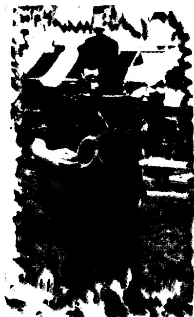
Paul Plays It All kept students entertained