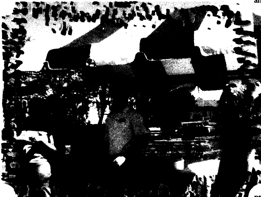
SGA and Student Activities serve up subs for students