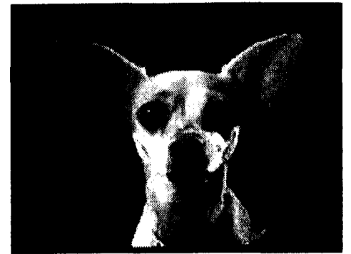
Have you seen me? If so call: 541-5046. Last seen near the 5000 block of Jonestown Rd.