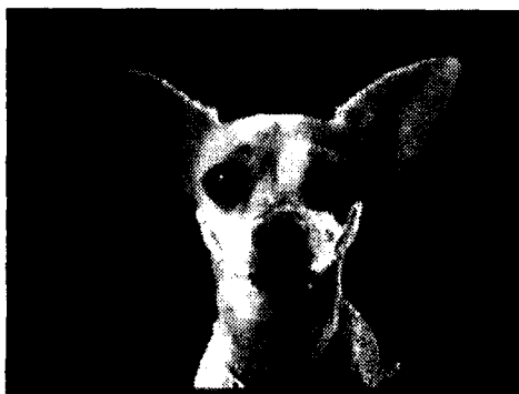
Have you seen me? If so call: 564-5398. Last seen near Harrisburg East Mall.