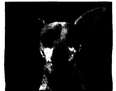
The rare Hawaiian Rodentia Muridae Tacobellius commonly called by its native name, Chihuahua (Ka hoo a' hoo a).