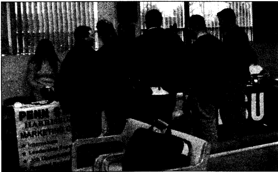
Campus organizations staff tables in the Gallery Lounge during Clubfest January 17.