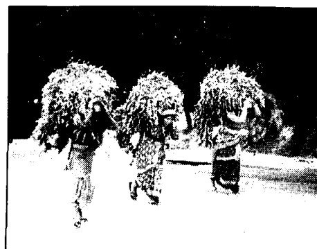
Urban Nepalese women walk many miles to gather food for their grazing animals.