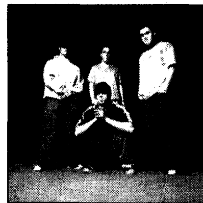
Project 86 - Drawing Black Lines