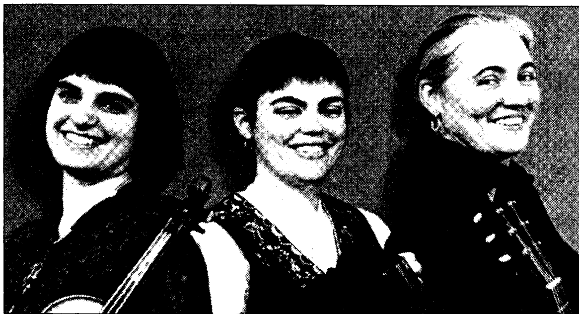
Simple Gifts will perform their style of classic, folk and Renaissance music in the Gallery Lounge at noon on November 10.