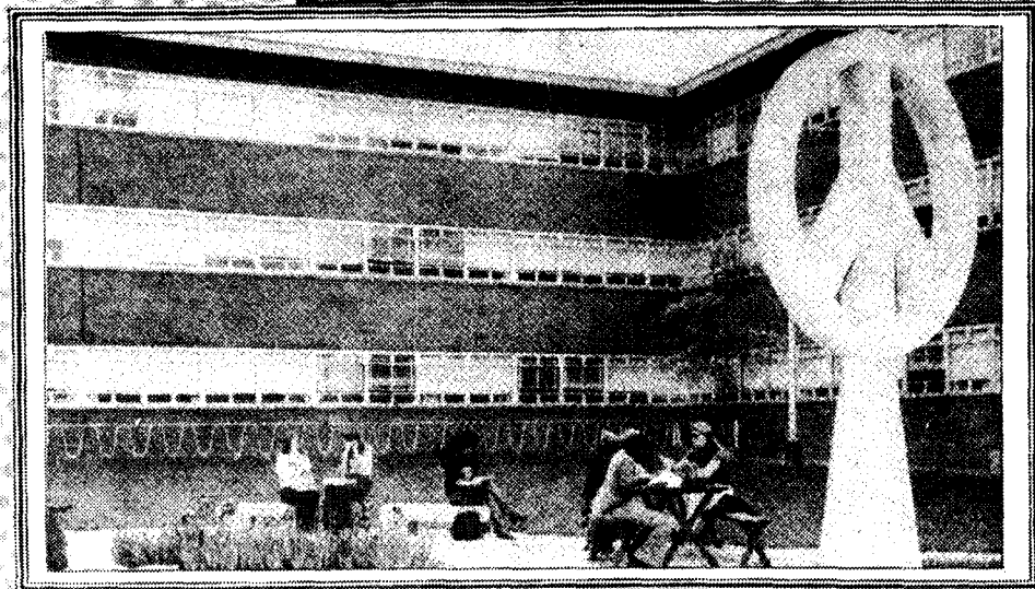
Peace Sign monument, which now stands near Engineering Lab, was built by students and erected behind Olmsted Building in the early 1970s as a plea for peace.