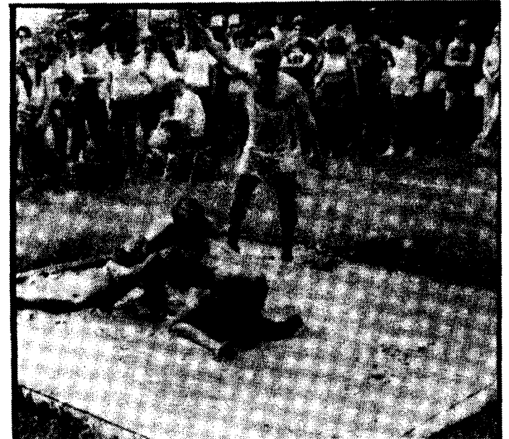
B Mud wrestling tournament held near dorms as part of "Rites of Spring" in 1983.