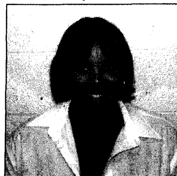
Elizabeth Downs Information Systems

Prices of parking permits vary from campus to campus. Hopefully they will lower it. Bookstore prices are also hard to swallow.