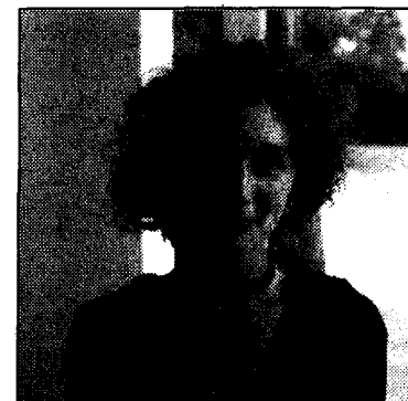
Jena Laske Communications

I would like to see more activity and campus function forums addressed. It would be great if this campus & the SGA involved everyone as a whole.