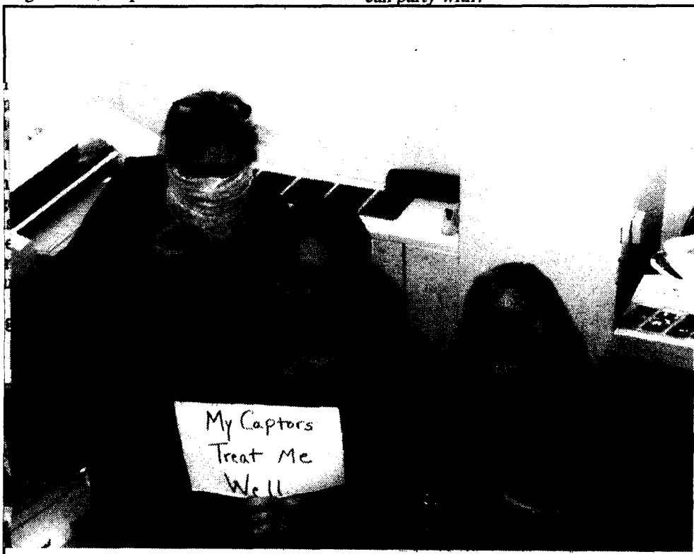
Don't get paid, but we do party.