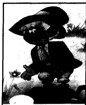
The Keebler Elf

"I used to hang out with him at the gym. I never suspected a thing. He looks soft. He needs to go back."