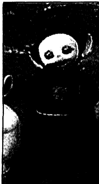
"Have you seen my purse?" -Tinky Winky

"We've hired him to be our spokesperson for our new cookie: the Fag-Newton."