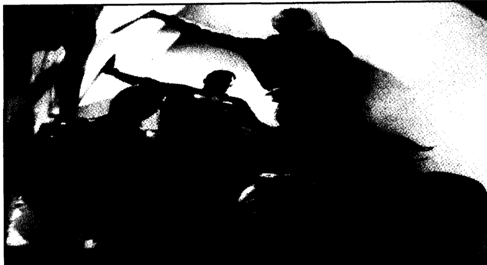
The Deftones, shown here on their latest CD "Around the Fur" will bring their unique blend of rap, punk and metal to the Electric Factory this Saturday at 8:30 p.m.