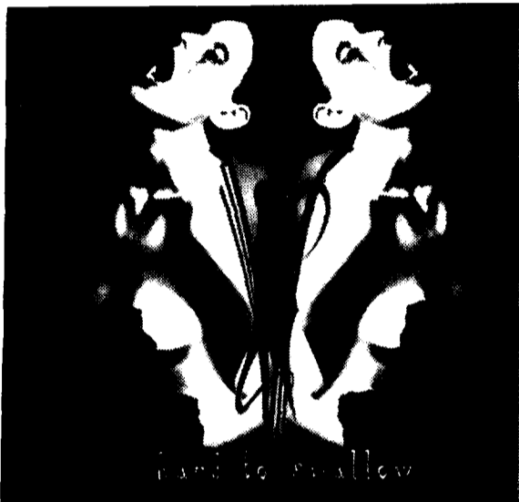
Hard to Swallow hit stores on October 20 and was produced by Ross Robinson

Go out and get this disc. It is by far one of the best comeback albums ever.