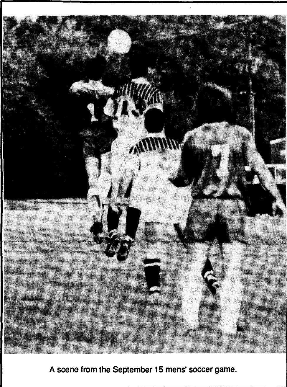
A scene from the September 15 mens' soccer game.

Here's a parting thought: how long do you think it took the ad wizards at Nike to dream up "Godzilla v. Charles Barkley"? Peace.