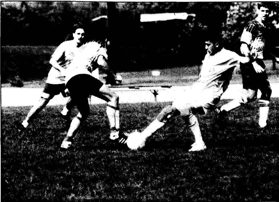
Past and present soccer players struggle for possession of the ball.

On Oct. 4, the alumni and the present varsity rosters at Penn State Harrisburg competed in four sports. In soccer, the present team defeated the alumni by a score of 3-2. The varsity basketball team also beat players from past squads with an 80-73 victory. The baseball team played past diamond players in a two-game softball series. The current team beat the alumni in the first game by a score of 18-5, but in the finale, the alumni got revenge with a 15-10 win. The women's alumnae volleyball team defeated the present squad in a heart-filled game.