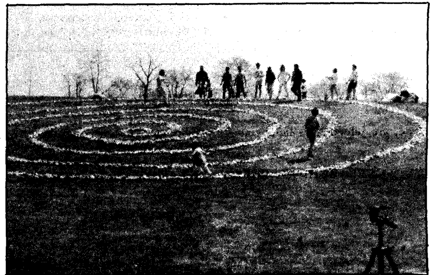
Troy Thomas putting aluminum cans to use.