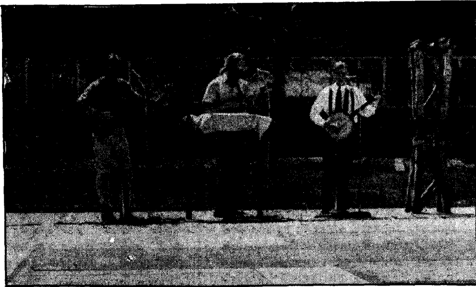
"All Strung Out" performing at the Provost Picnic.