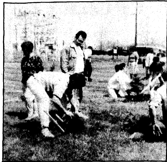
Planting more trees.