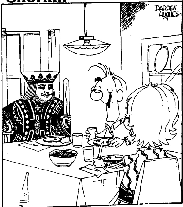
Your daughter tells me you're in the playing card modeling business.