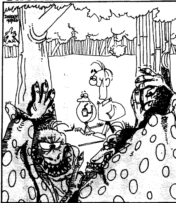
I'm trying to watch my weight, so I'll take the one on the left.