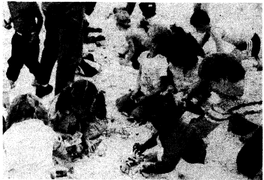
Candy, Games Toys !!!