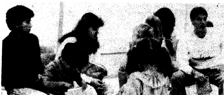
Mom, Dad! Look what I have!