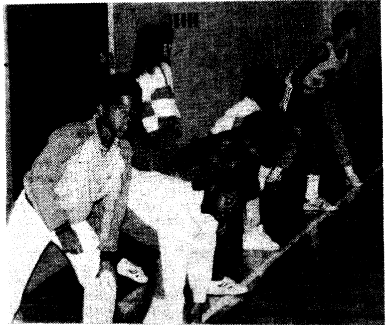
Ready, set..... Let the games begin!