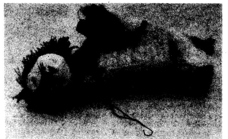
And then the children were gone.