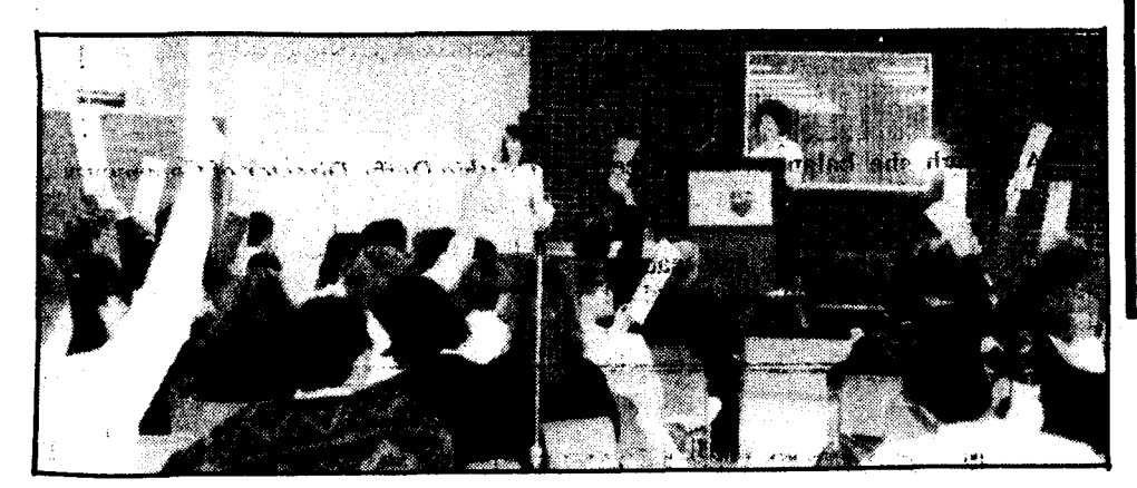
Delegates voting on issues at the Model U.N.