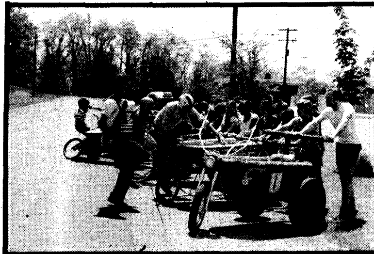
Pre-race inspection of tubs at the starting line.

The winning team won a five-foot trophy and a keg of beer, which was presented at the conclusion of the races at club-sponsored cookouts. For many years this was the major attraction of "Rites of Spring, the May celebration honoring the end of the semester.