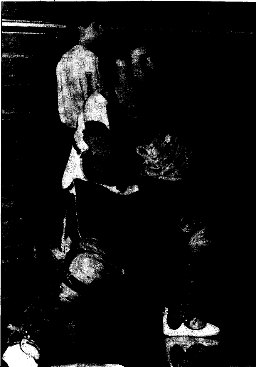
Pre-season baseball team workouts were held in the gym.