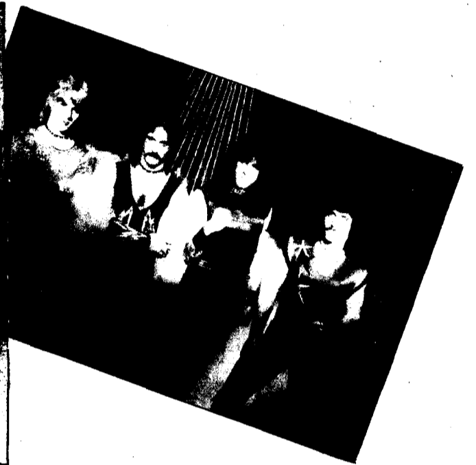
Philadelphia's No. 1 Heavy Metal