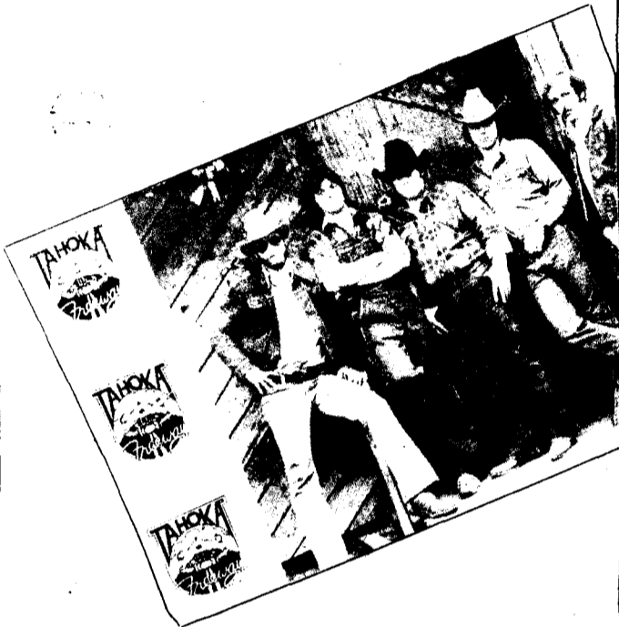
The Pride of State College