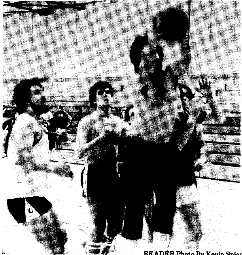
READER