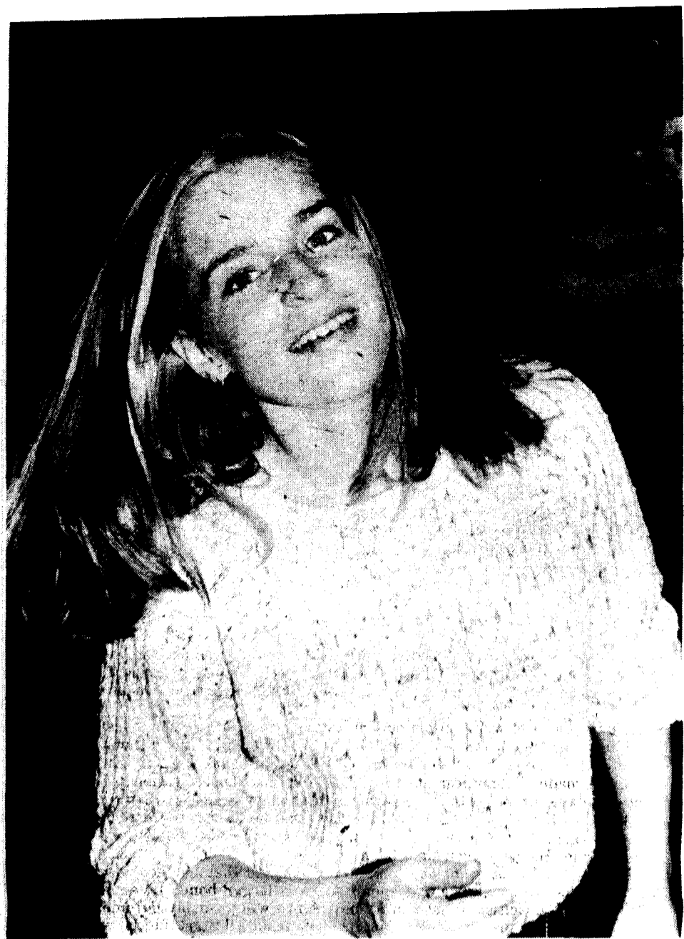
There was plenty to smile about at the "After The Bash Bash."