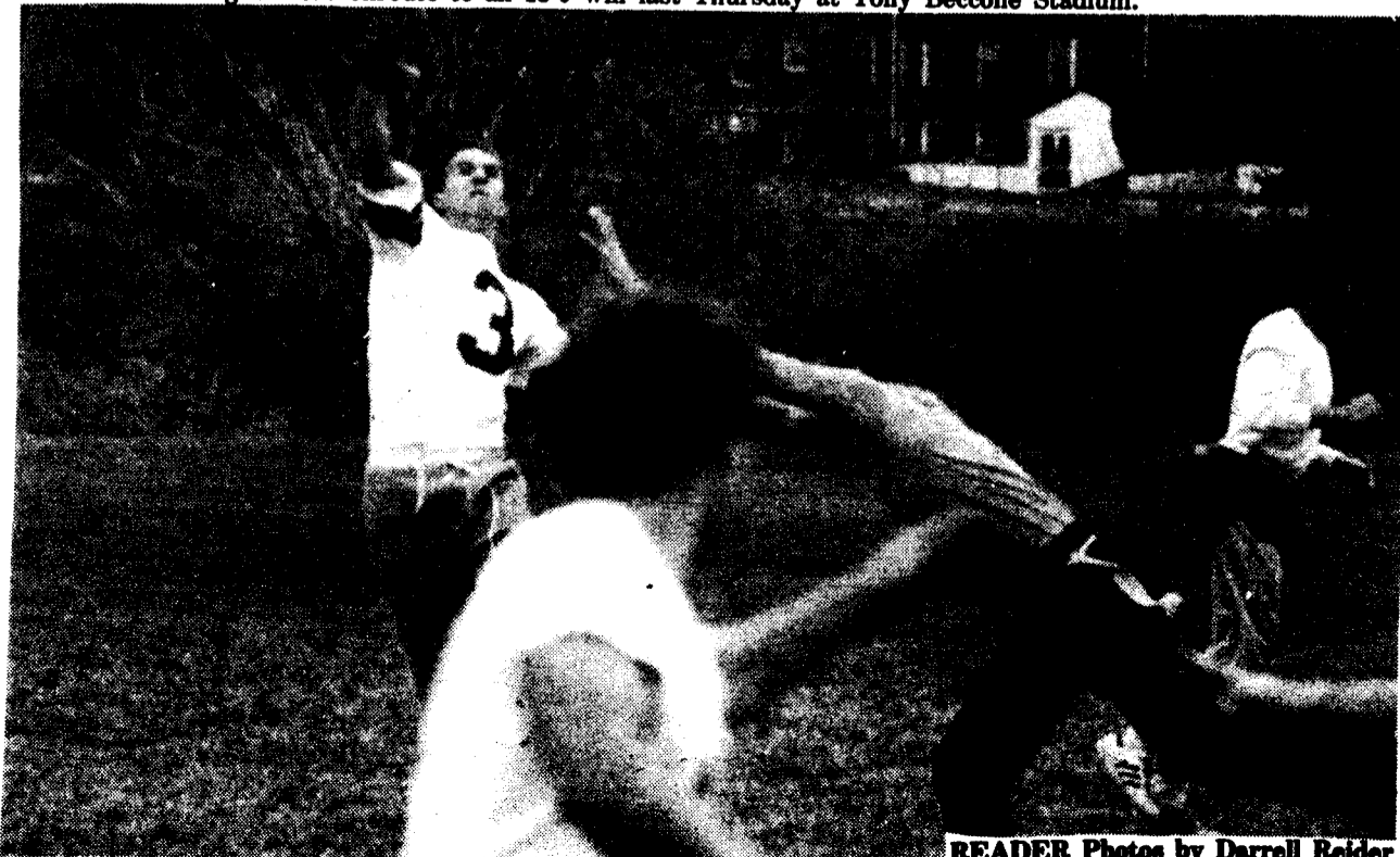
READER