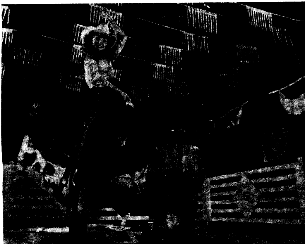
Photographed at San Antonio Rose, Houston, Texas.

Digicon talks straight. About jobs available and career opportunities, before you join us and after. We're a Houston-based geophysical services company with U.S. and international operations in land and marine seismic data collection and data processing. We have a solid record of growth: at the start of the decade, an almost 40 percent rise in revenues and a 40 percent workforce increase. We need good people to help us continue this growth. Our recruiters will be on campus soon. If you're interested in talking about your career in terms of more than an excellent starting salary, we want to talk with you. Straight-away.