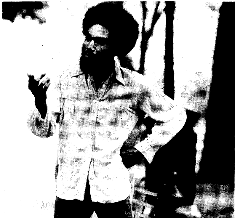
Young Mr. Douglass covers the first 32 years in the life of the escaped-slave-turned-anti-slavery-lecturer and newspaper publisher who ultimately became one of the outstanding figures of the American nineteenth century. This dramatic portrayal will take place at 12:15 p.m. Thursday, January 29, 1981, in the Main Building Auditorium.

As I said, this is a good one-funny, fast-paced, replete with stereo music and visual scenery, worthy performances by an international cast, and a not-too-heavy plot to avoid overloading the circuitry. It is now playing at the Eric Theatre in the East Towne Mall.