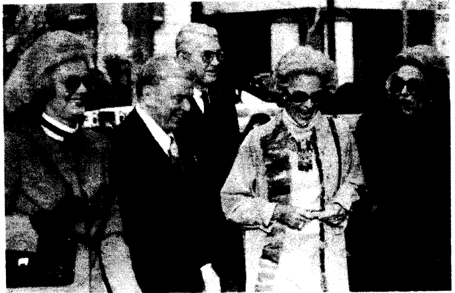
Frank Sinatra and Jimmy Stewart at the inauguration

The 1984 sequel is a must. Hooray for Hollywood!