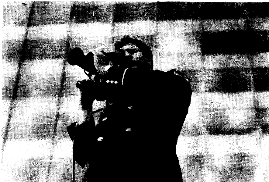
A Washington policeman videotapes Yippie smoke-in at Franklin Park