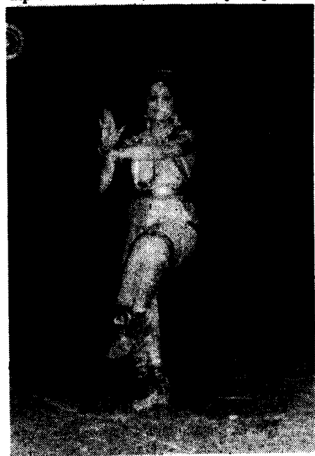
Lakshmi Anand will perform at the Indian Dance and Cultural Program on October 30 at 7 p.m. in the auditorium. Admission is $1.00 for students and $2.00 for others.

I'll admit that Reagan has advocated using U.S. troops on occasions when the incidents were later resolved by peaceful diplomatic means, but that just proves