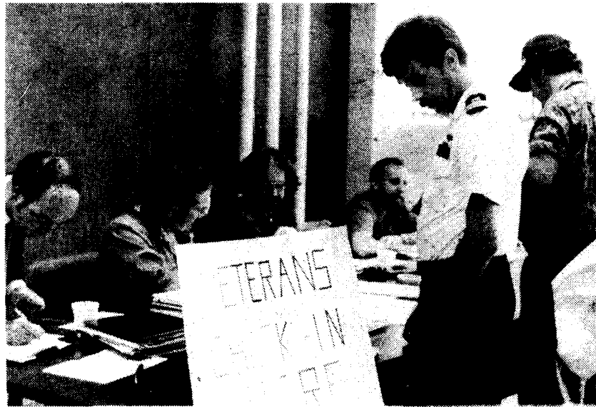
The XGI's are planning a blood drive in November. Anyone interested in organizing the drive should inquire at the XGI lounge, W-114.

Many more trips and get-togethers are being planned, so please come join us at our next meeting which will be on Tuesday, Oct. 14 at 7:30 p.m. in the Student Center.